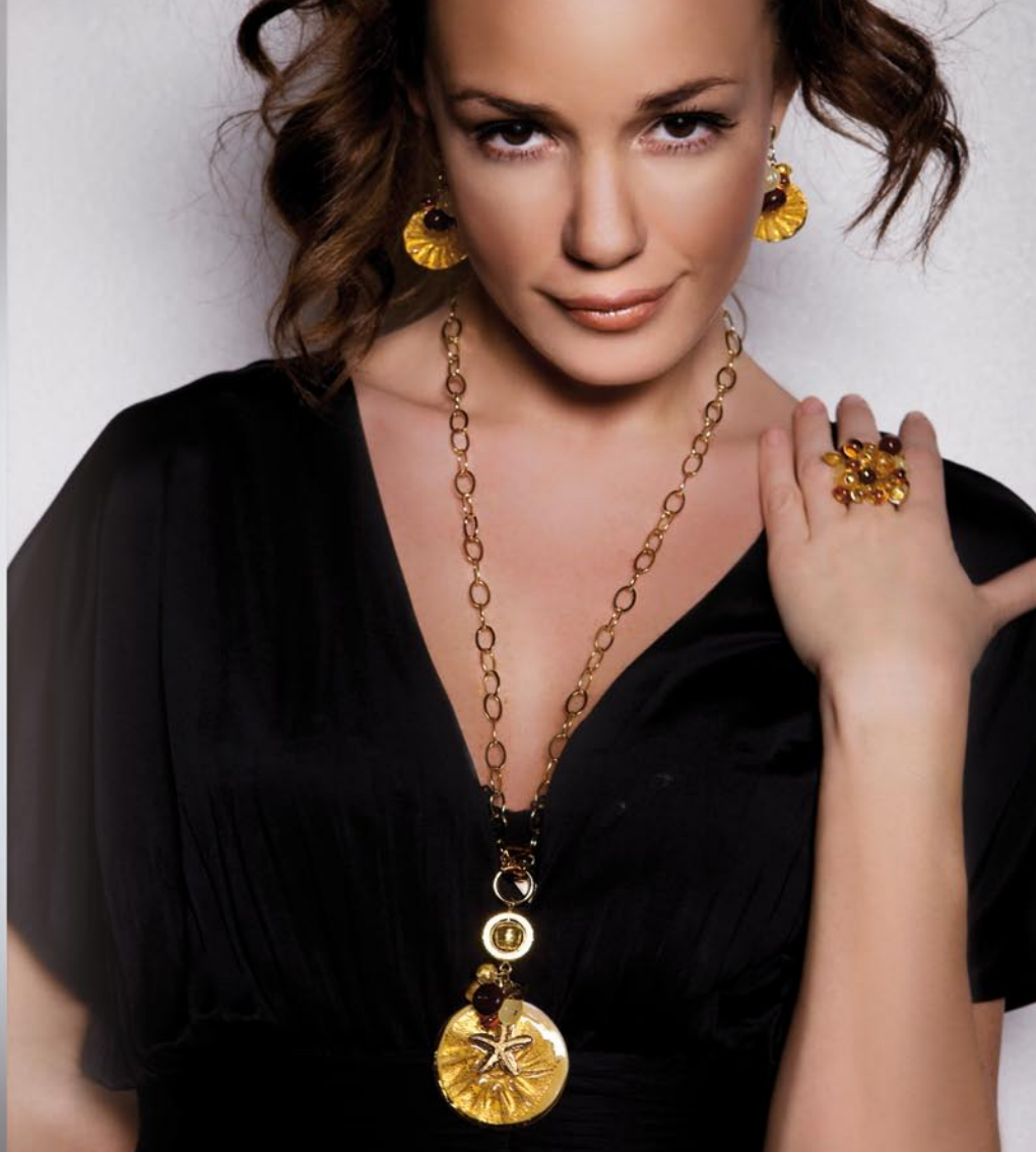
PASHA NECKLACE - EARRINGS - RING