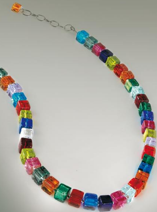
ENIGMA NECKLACE - BRACELET