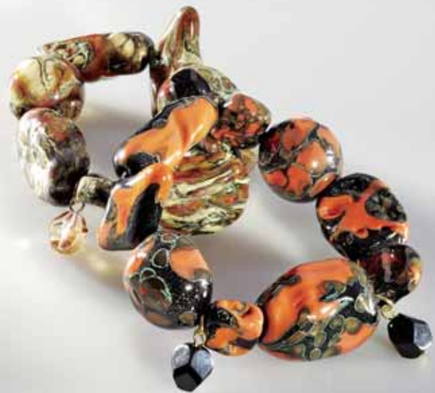
STONE NECKLACE BRACELET EARRINGS