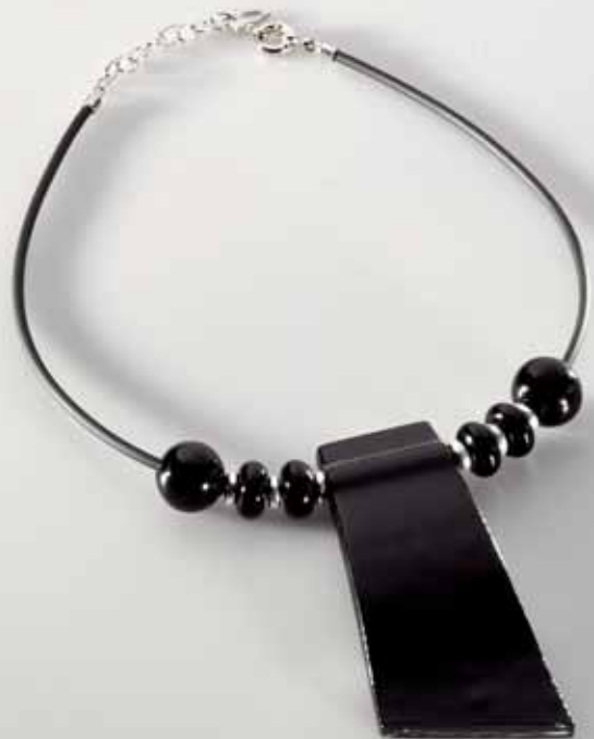
CHARLIE NECKLACE EARRINGS