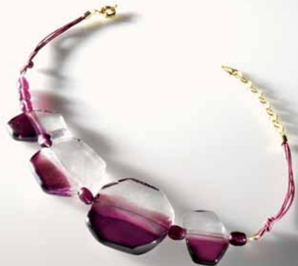
ICE NECKLACE BRACELET EARRINGS