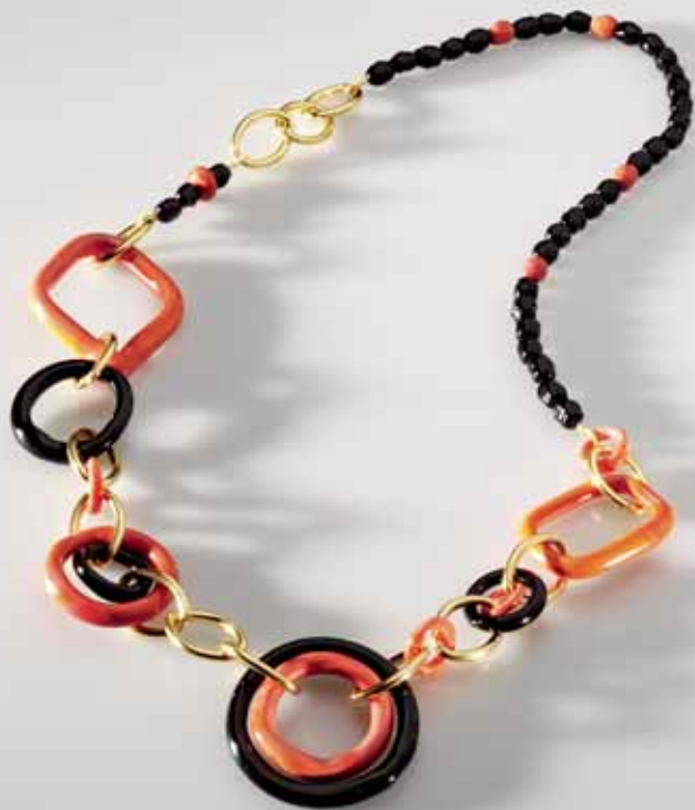
BENNY NECKLACE BRACELET EARRINGS