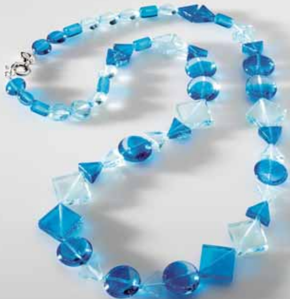
MAILA NECKLACE BRACELET EARRINGS