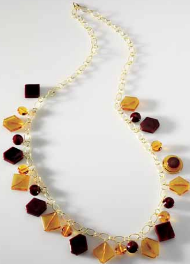
COCO NECKLACE BRACELET EARRINGS