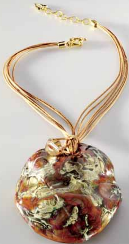
PETRA NECKLACE EARRINGS